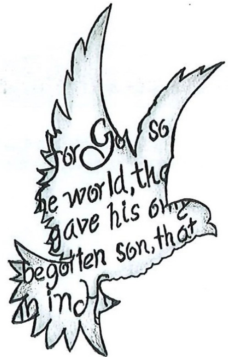
Art by Alan O.

Crossroads | PO Box 900 | Grand Rapids, MI 49509-0900